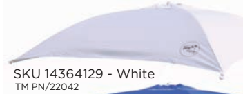
SKU 14364129 - White TM PN/22042